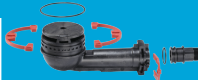
Quick Connect Drain Fitting